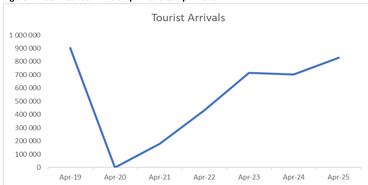
Figure 1: Total Tourist Arrivals April 2019 to April 2025

A total of 827 886 tourist arrivals was reported in April 2025 which was an increase of 17,9% (125 865) compared to the same month in 2024. Figure 1 below shows tourist arrivals for April 2019-April 2025 period. In April 2020, due to the closure of country borders and travel restrictions in place, there were no tourist arrivals recorded for the month. However, in April 2021, with the opening of country borders and travel permitted, there were 177,251 tourist arrivals recorded. Tourist arrivals then increased from 177 251 in April 2021 to 431 376, same month in 2022; and this was an increase of +143,4% (+254 125). Tourist arrivals grew by +65,4% (+282 094) in 2023 compared to 2022; and a slight decrease in arrivals of -1,6% (-11 449) in 2024 was seen compared to 2023. Tourist arrivals reported during April 2025 were at -8,3% level of tourist arrivals experienced in 2019, pre-COVID period Easter holidays occurred from April 18–21 in 2025, compared to March 29–April 1 in 2024. As a result, the figures for April 2025 may be positively influenced by the timing of the Easter holidays.